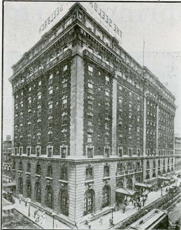
Seelbach Hotel, Where the Western Normal and Teachers College will have its headquarters

A special train will be run to Louisville by the L. & N. for the benefit of the faculty and students of the Western Normal and Teachers College. A very low rate has been secured. The train will leave Bowling Green at 5:00 a. m. April 24th and return some time Saturday night. The number of students who will attend the K. E. A.