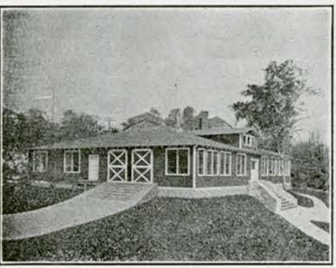
The New Manual Arts Building, recently constructed on College Heights. This building is not included in the group of buildings shown above. The Manual Training School will be in active operation during the entire Summer School of twelve weeks.