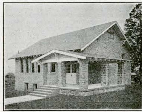
The New Model Rural School conducted on the campus of the institution. This building is not included in the group shown above. The Rural School will be in operation during the first six weeks of the Summer School which begins June 8th.