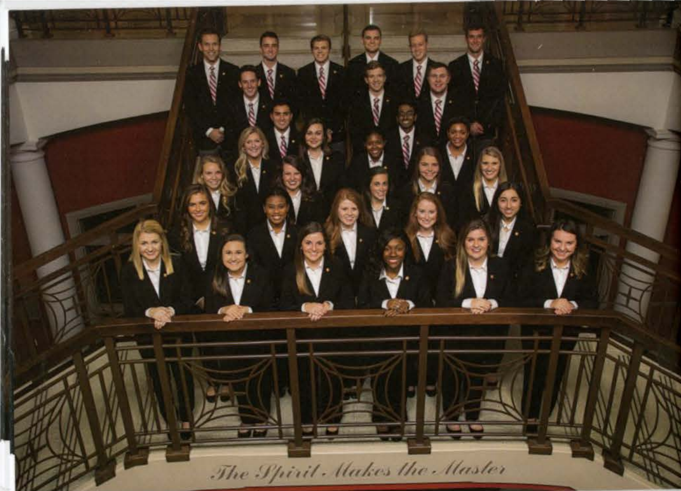
The Spirit. Makes the Master