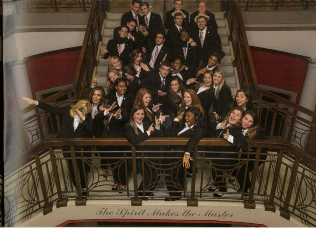
The Spirit. Makes the Master