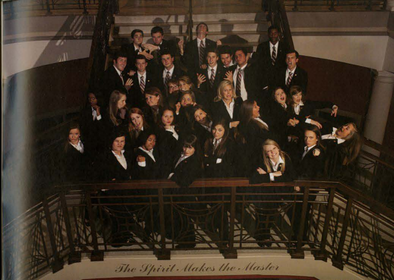
The Spirit Makes the Master