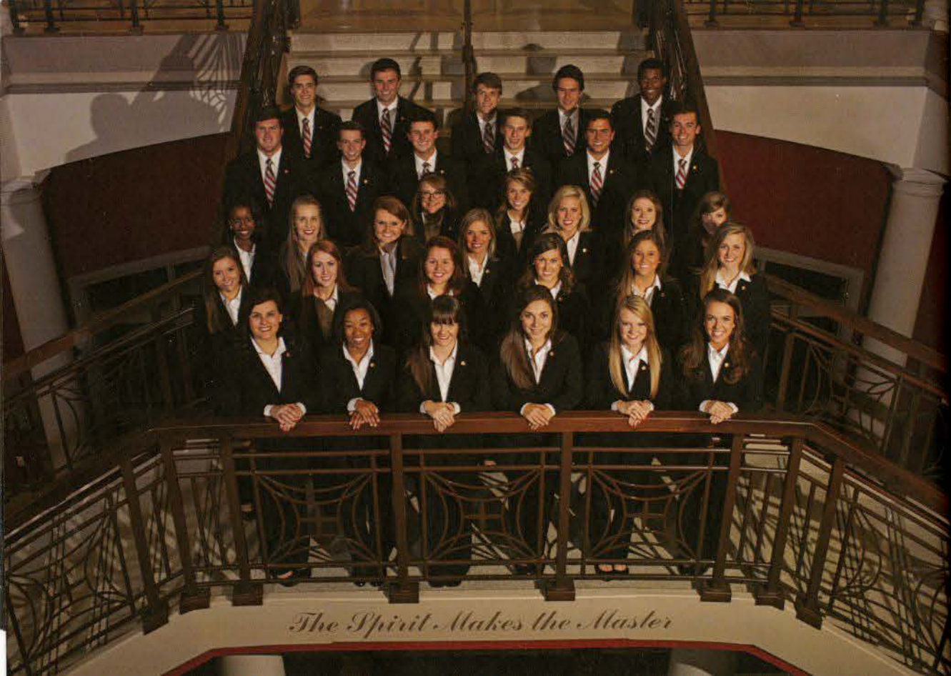
The Spirit Makes the Master