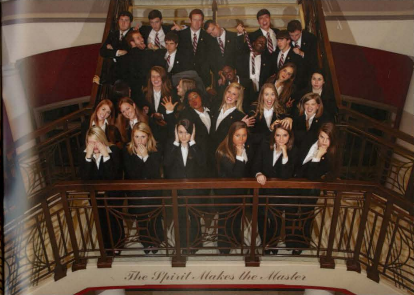
The Spirit. Makes the Master