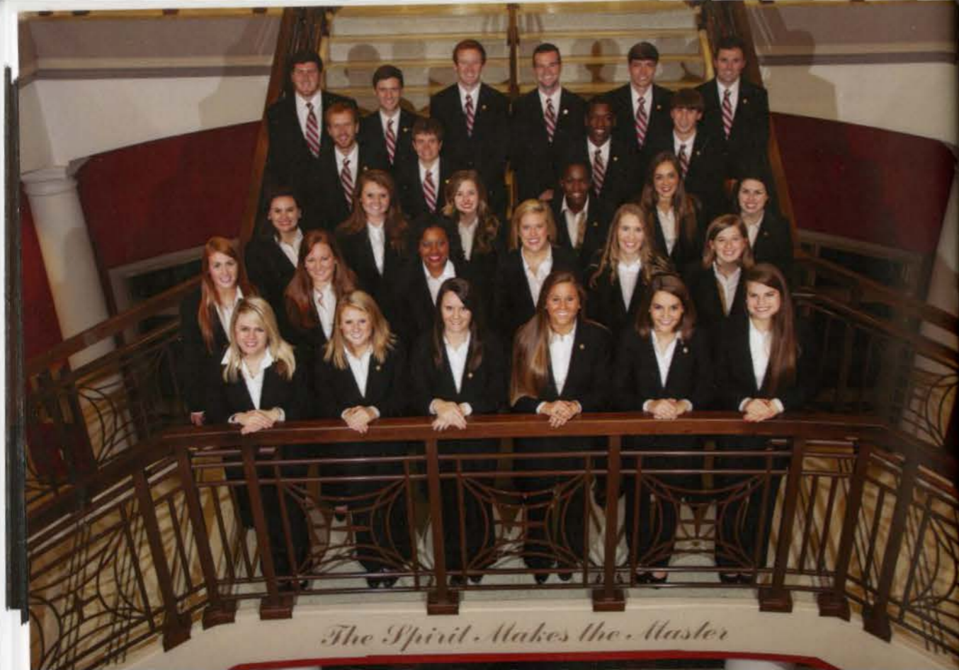
The Spirit. Makes the Master