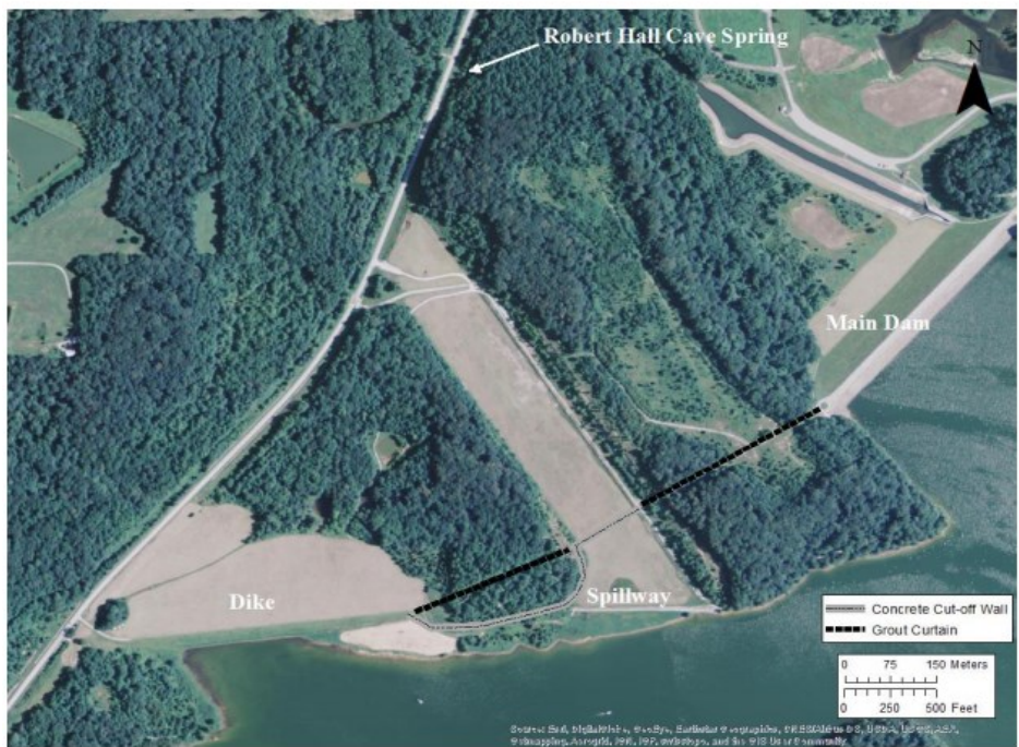
Figure 1. Aerial view of study area

the Glen Dean Limestone, and spring hydrograph analysis was performed to better understand local groundwater hydrology in the vicinity of the existing water control structures that include the dam, grout curtain, dike, and concrete cut-off wall (Figure 1). The previous 2008 risk analysis identified potential failure modes, one of which was abutment seepage and piping failure of the dike and therefore efforts were focused in this area. Results identified the general local flow direction as south to north and indicate that a limited amount of groundwater is bypassing the control structures in the vicinity of the cut-off wall (Figure 2). Groundwater travel times within the Glen Dean Lime-