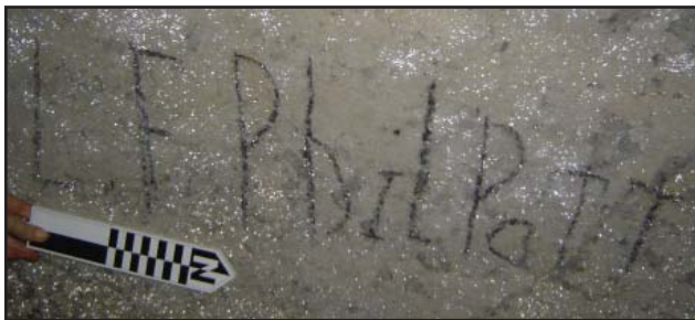
Figure 5: Undated charcoal signature of L. F. Philpott on the ceiling of the trunk passage at 90.0 m from the cave entrance. The Philpott family has a connection to property in the vicinity of Forestville Saltpeter Cave. Around the turn of the twentieth century Curtis C. McCoy married Martha E. (Philpott) McCoy and the family resided in the Forestville area until at least the 1930s. In the early twentieth century Curtis McCoy's parents, Washington Alexander and Dilemma (Ewing) McCoy owned the farm on which the cave is located (Applegate 2007).

There are five other types of evidence potentially related to mining operations at Forestville Saltpeter Cave, though it is likely that some derive from other cave visitors. There are 102 historic inscriptions on the cave walls and ceiling throughout all passages. Some of the inscriptions are decipherable and many are illegible. The inscriptions include names, initials, dates, and words like "HELP." Name signatures were made by incising with a sharp tool or, more commonly, with charcoal (Figure 5) or candle/torch smoke. Several contemporary signatures are in crayon and chalk. Nine inscriptions are dates or include dates ranging from 1872 to 2004,