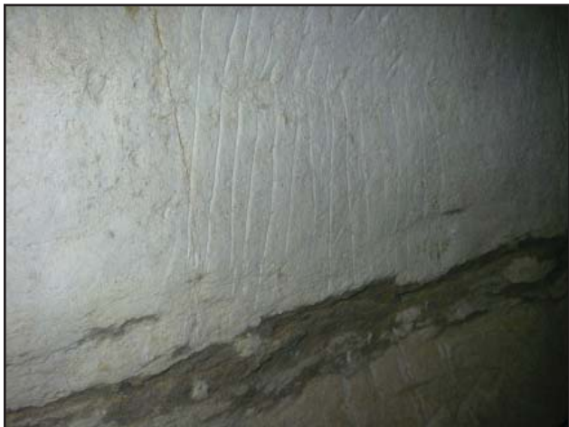
Figure 4: Set of 15 vertical tally marks in the south wall of the trunk passage at 162.7 m from the cave entrance.

Tally marks represent a third line of evidence of the mining activities at Forestville Saltpeter Cave (Figure 4). The marks are scratched or incised into the rock of the cave walls. The typical form of the tally marks is vertical lines, which can be long or short, thick or thin, shallow or deep. Some tally marks have horizontal or angled incisions across the vertical lines. There are 66 sets of tally marks, and an additional ten possible sets, throughout all passages of the cave. The number of lines within any one set ranges from 2 to 30. We recorded at least 631 tally marks associated with the mining activity at Forestville Saltpeter Cave.