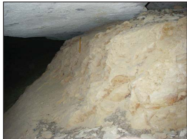
Figure 3: Vertical face of working bay along north wall at 120 m from cave entrance.

Saltpeter Cave. The most obvious evidence is the working bays where the peter-laden soil was mined. A working bay is a “cavity produced by the mining of soil . . . identifiable as a niche in a soil bank bounded on three sides by a high wall excavation face” (George 1986b:96). Working bays are present throughout all passages within the cave, where their dimensions vary depending on the depth of the cave sediments and the size of the cave passage. There was extensive sediment mining in the vestibule of the cave, where a medial trench measures as much as four m wide and three m deep (though it is possible the entire vestibule was mined and the trench represents a trail between lateral piles of re-deposited processed sediment). Midway through the trunk passage the face of the excavated sediment is as much as four m high (Figure 3). The miners also removed sediment from lateral ledges along the trunk passage in the vestibule. The ledges are one-two m above the current cave floor, but they likely were below the floor of the infilled cave prior to mining. As such, the ledges were exposed by the mining and do not represent balcony alcove working bays (c.f., George 1986b).