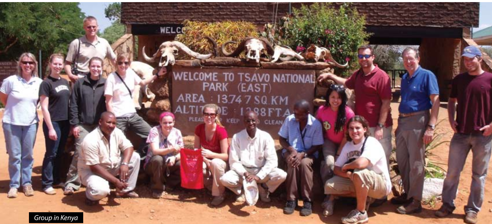
Group in Kenya

There were 79 WKU students who studied abroad in Winter Term. Students went on trips to Australia, England, France, Belize, Kenya, and the Bahamas.